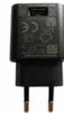
AC/DC Adaptor (EU example)