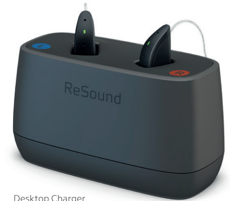
Desktop Charger (N/A in Canada for ReSound Omnia)